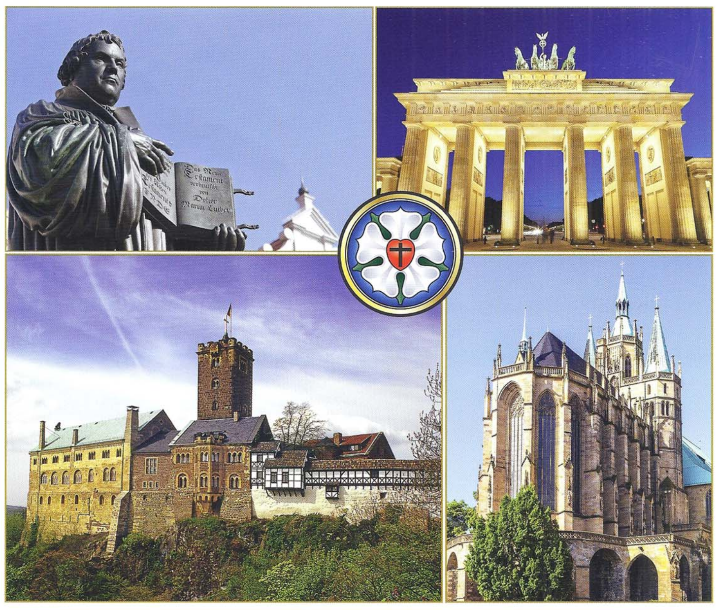
THE LEADER IN LUTHERAN TRAVEL SINCE 1949

(Air/land tour price is $3209 plus $690 government taxes/airline surcharges)